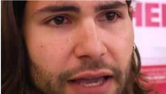
He's Not The Same: NY Council/Outreach Arts